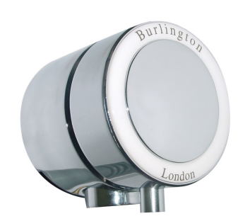
for single ended baths